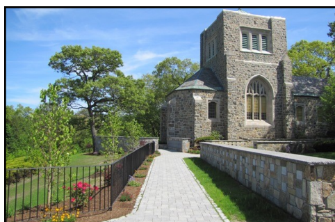
Chapel Hill IV Cremation Wall

What to expect the day of burial? The family is asked to gather at the cemetery