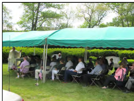
Memorial Day Holyhood Cemetery 2015