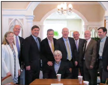
Holyhood Cemetery Association BOD