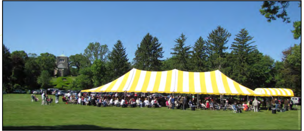
Memorial Day St. Joseph Cemetery 2015

“The willingness of America’s veterans to sacrifice for our country has earned them our lasting gratitude”