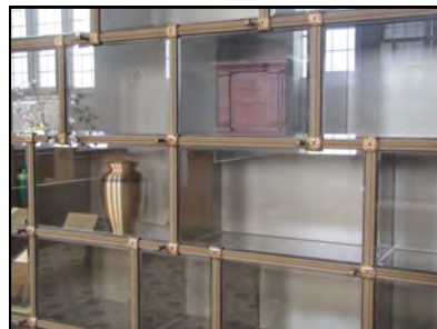
Maguire Chapel Niches

Maguire Chapel landscape and pavement upgrades have commenced. The front section of the Chapel will be enhanced with granite curbing and colorful planting. The chapel provides a display of beautiful glass niches for cremation interments.