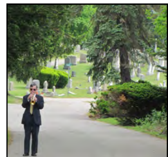
Taps at Holyhood Cemetery signals the end of Mass